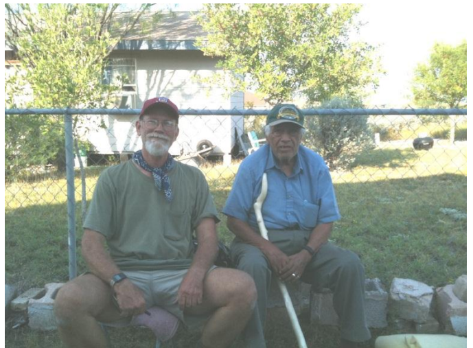
Those who oversee