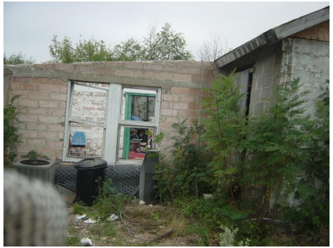
Back door area upon arrival.