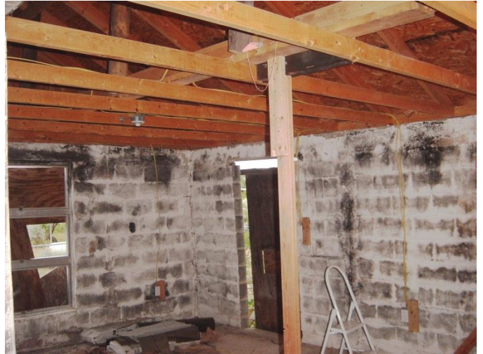
door entrance area from the kitchen - was one long room