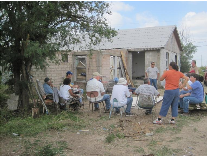
Lunch time in the back yard. Note: add-on rooms, no door, windows.