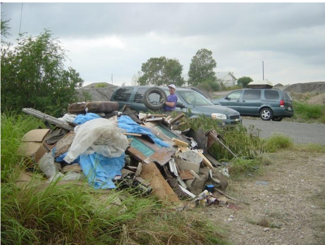
This is the debris and trash waiting to be picked up.