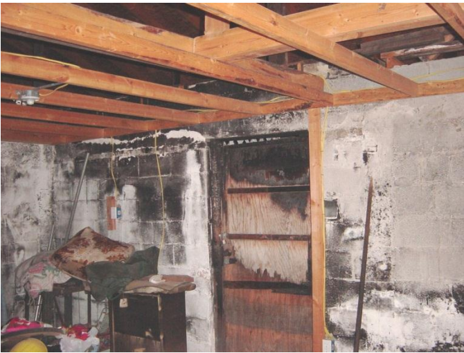
Front door - living room. Another team had done roof/rafters