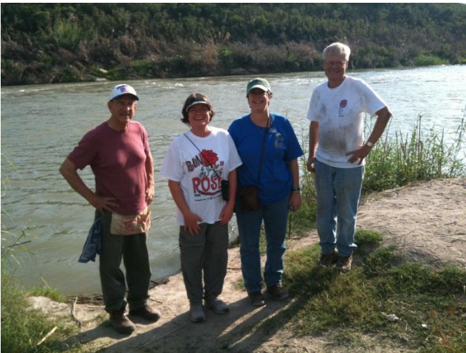
Break time to check out the Rio Grande