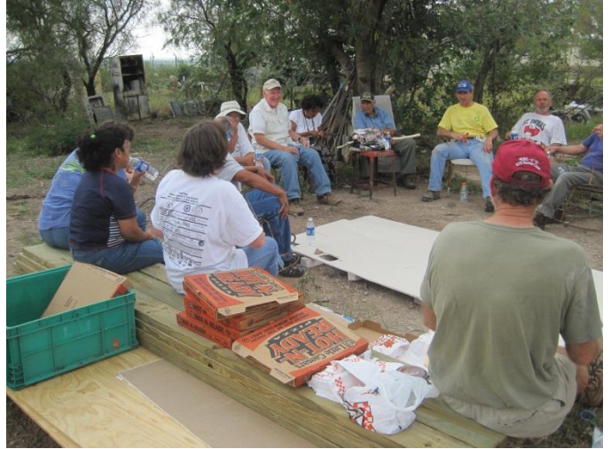
Gathered for Pizza Meal around and on building materials