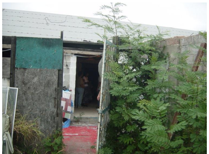
The other added room in back