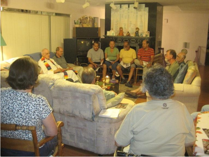
Gathered around the Table of the Lord