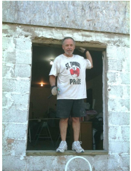
The new window pain?