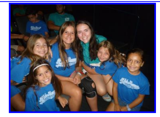
SJV girl campers enjoying the field trip.

Campers started off the week with another visit to the church for a lesson on the virtue of Faith and the mosaic associated with it. On Tuesday campers prepared their own personal pizzas which they enjoyed for lunch. After lunch, the 7-12 year old campers walked to the Nottingham neighborhood pool where they swam for the remainder of the afternoon. Campers prayed the rosary on Wednesday in the chapel along with their regular camp day activities including arts & crafts and outdoor recreation. The 4-6 year old campers had a "Wacky Water Day" on Thursday while the 7-12 year old campers were enjoying a Main Street Theatre performance of "The Wizard of Oz" and Double Dave's Pizza. Ms. Monkey paid a visit to Camp SJV on Friday bringing with them 3 monkeys that campers had the chance to interact with. After a brief Q&A session the campers got the chance to take individual pictures with the monkeys. Campers finished off the week with ice cream and skit performances where the 7boys were awarded the 8 performance of the week trophy.