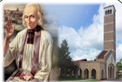
Archdiocese of Galveston — Houston

625 Nottingham Oaks Trail Houston, TX 77079