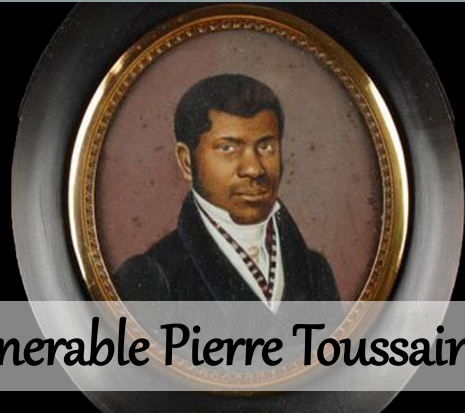
Venerable Pierre Toussaint's

Born in modern-day Haiti and brought to New York City as a slave, Pierre died a free man, a renowned hairdresser, and one of New York City's most well-known Catholics.