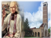
Archdiocese of Galveston — Houston

625 Nottingham Oaks Trail Houston, TX 77079